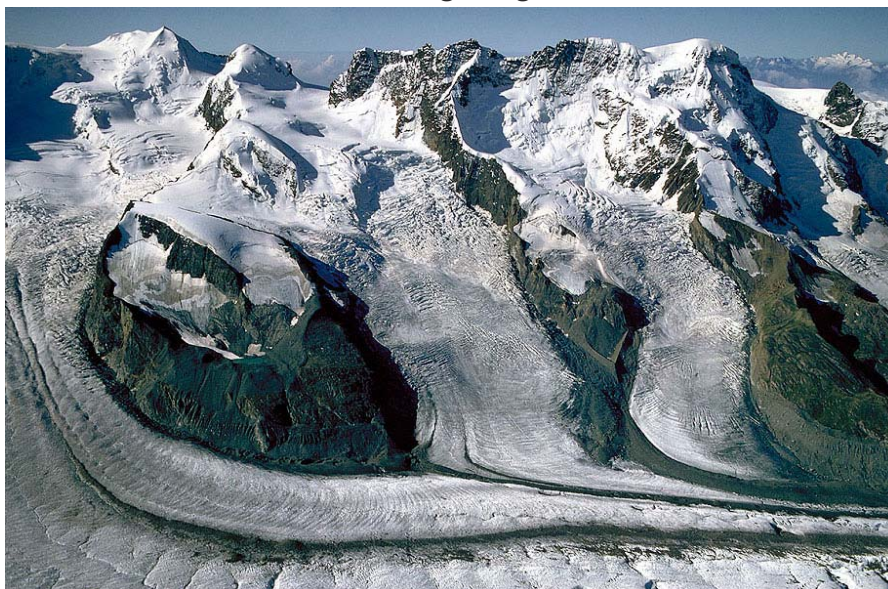
Breithorngletscher (right) and Schwarzgletscher (centre) flowing off Breithorn (4164 m) near Zermatt, Switzerland

To contact ESR: peter.fischer@hest.ethz.ch - https://rheology-esr.org